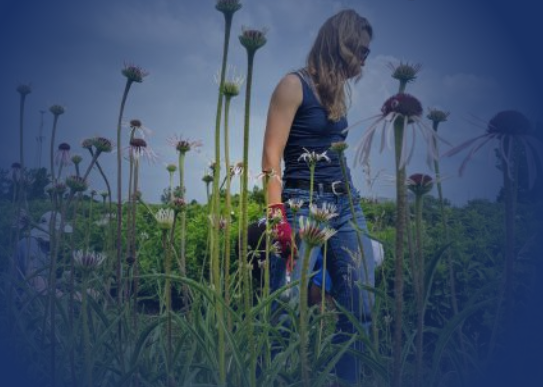
Pale purple coneflower ( Echinacea pallida )

The Iowa Roadside Management program works with county roadside programs to achieve the long-term goal of establishing diverse stands of native plants along roads.