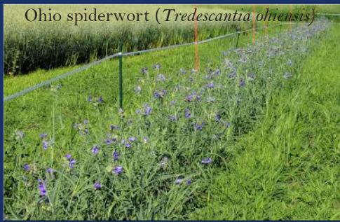
Ohio spiderwort ( Tredescantia ohioensis )

The Plant Materials Program produces seed descended from Iowa's remnant prairies. The TPC doesn't sell directly to the public, rather, we provide seed for native seed growers who use it to plant production fields. This supports a diverse native seed supply that is adapted to our region.