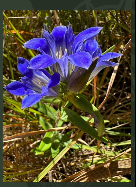
Downy Gentian ( Gentiana puberulenta ) at a Polk County Roadside Remnant

-THERE ARE A FEW ROADSIDE REMNANTS IN THE COUNTY. ONE EVEN HAS A FEW SPECIES WHERE THAT IS THE ONLY SPOT IN THE COUNTY THE SPECIES IS AT THAT I AM AWARE OF