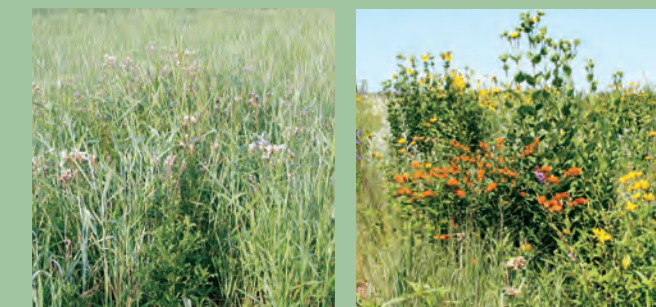
Invasion of Canada thistles into a species-poor native grass planting in Black Hawk County, Iowa.

A prairie seed mix that includes species from each plant group (warm- and cool-season grasses, legume and non-legume forbs, and sedges) will result in a stable, weed-resistant plant community and it will attract and sustain wildlife. A species-rich prairie planting will eliminate germinating weed seed by being a better competitor for resources. It may be inexpensive on the front end of the project to plant only a few grass and forb species, but eliminating weeds that have invaded a native planting can be difficult and costly down the road. Species-diverse seed mixes should be strongly considered for all native plantings.