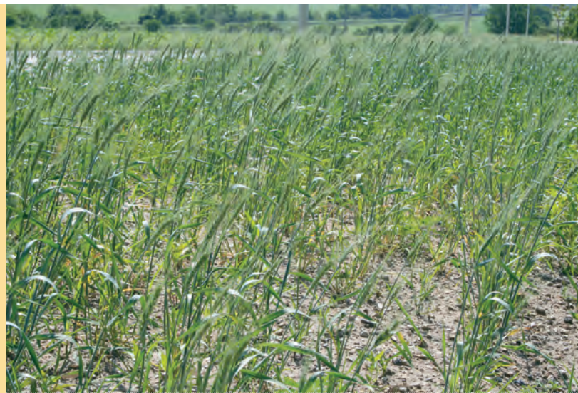
A roadside right-of-way planted in fall with winter wheat (nurse crop) and prairie seed. This photograph was taken the following spring – taller plants are winter wheat and shorter plants are natives.

Tallgrass Prairie Center, University of Northern Iowa Cedar Falls, IA 50614-0294 tallgrassprairiecenter.org — 2018