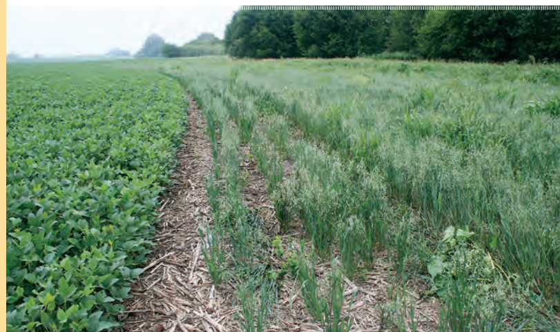
A CRP field planted to oats (right) and prairie seed in late spring to stabilize the soil and reduce weeds. Oats were planted at 1 bushel/acre and seeded with a no-till grass drill. Photograph was taken in late June.